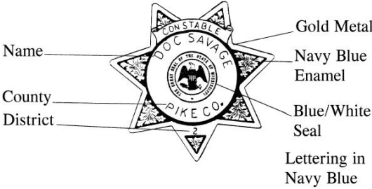
Figure 2 Badge